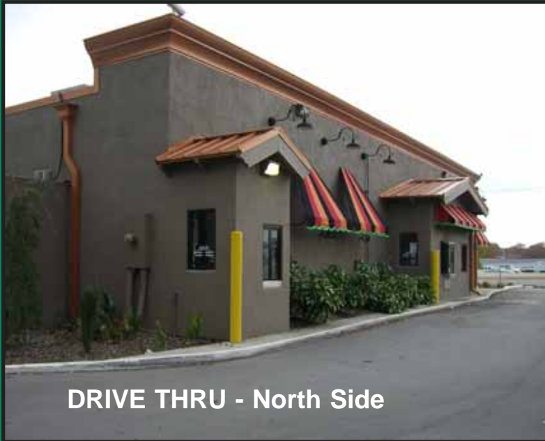
DRIVE THRU - North Side