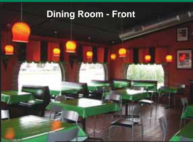
Dining Room - Front