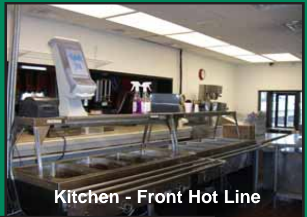
Kitchen - Front Hot Line